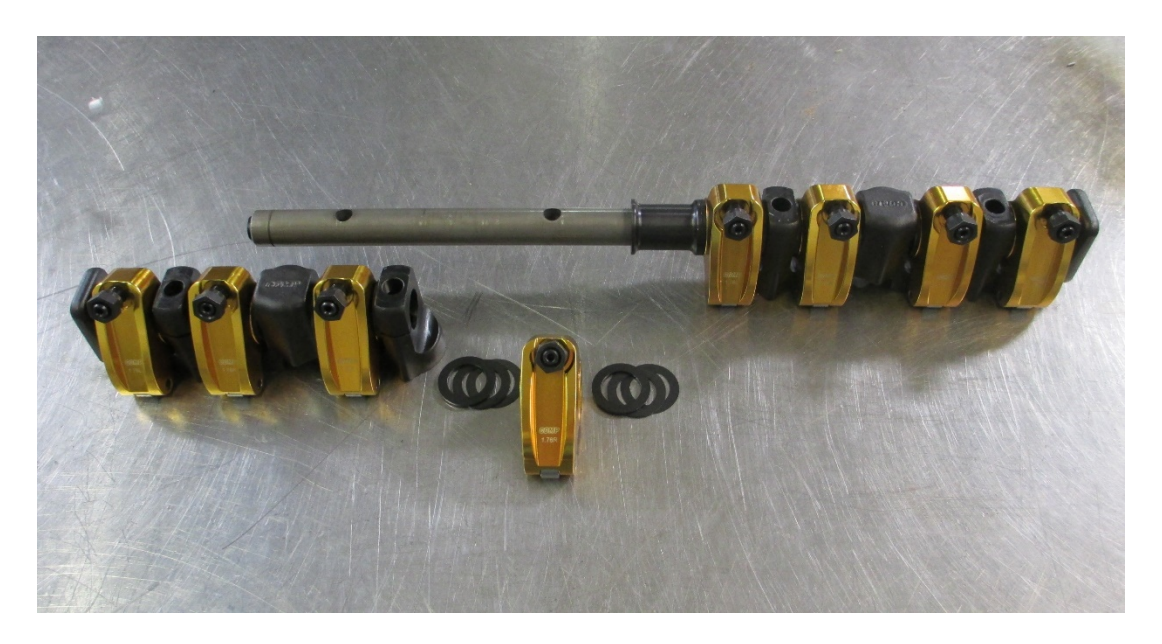
Fig. 5 - Rocker Assembly with Rocker Removed and Spacers Shown

Note: Each rocker arm comes with three spacers (0.015", 0.030", and 0.060") on either side of the rocker. These spacers can be rearranged to change the spacing of the rockers as needed. See Fig. 2 and Fig. 5.