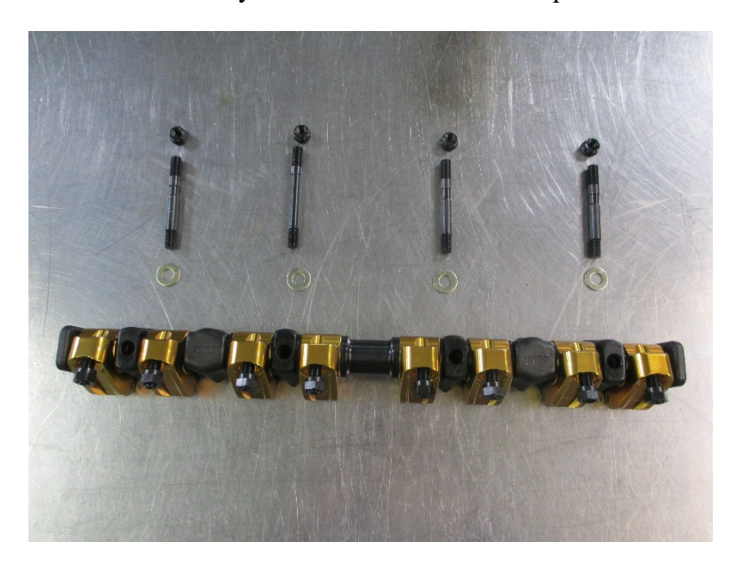
Fig. 3 - Disassembled Rocker Studs