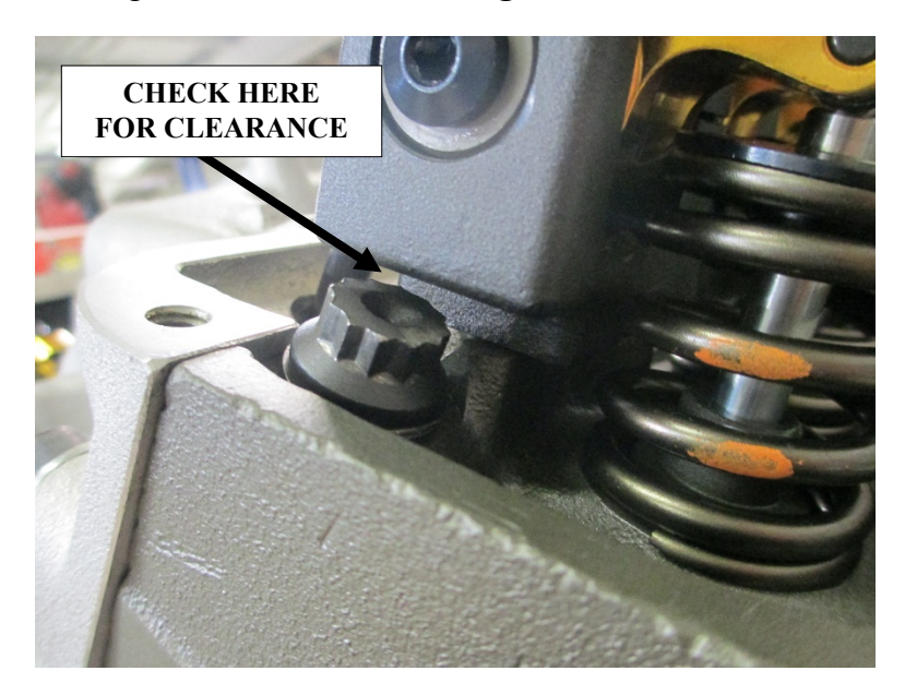
Fig. 6 - Bolt Head Clearance

Note: If aftermarket head bolts are used, clearancing of the bolt head may be required in order to prevent the head bolt from contacting the rocker stands. See Fig. 6 below.