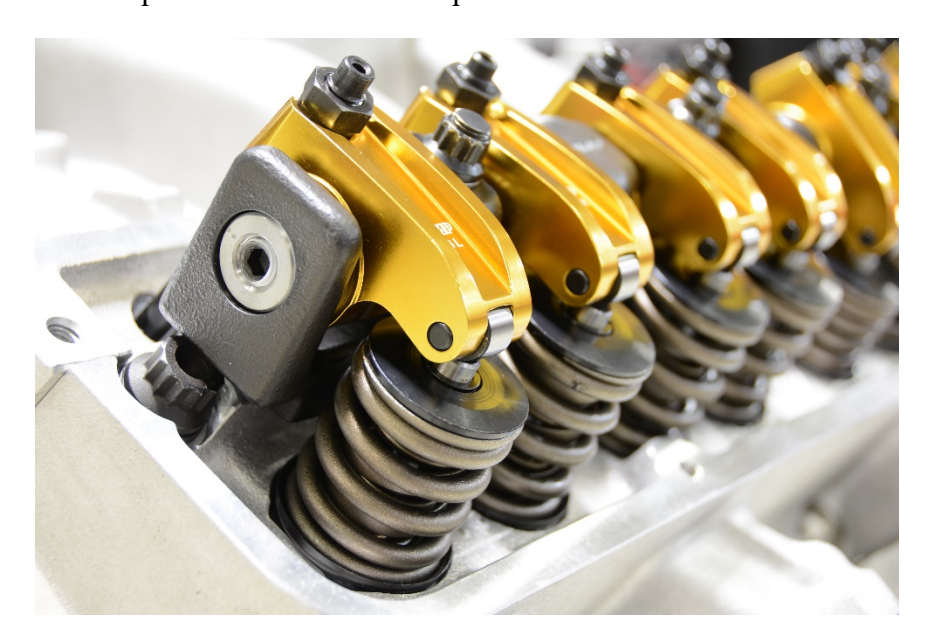
Fig. 7 - Finished Rocker Assembly

11. Reinstall the valve covers on the engine.