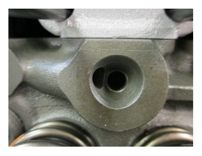
Fig. 4 - Oiling Stud Hole

COMP Cams® 3406 Democrat Rd. Memphis, TN 38118 Phone: 901.795.2400